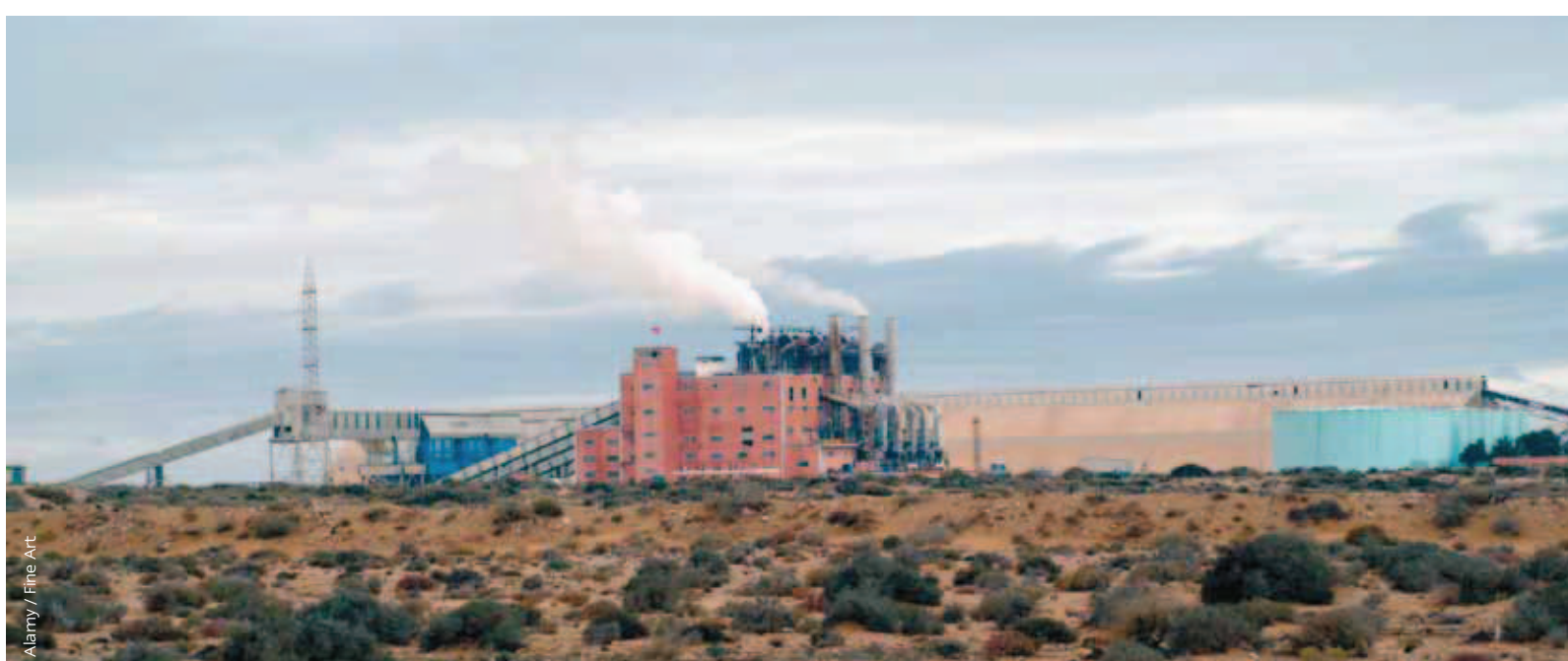
A phosphate factory in Western Sahara, Morocco.

this commodity the main determinant of global economic development.