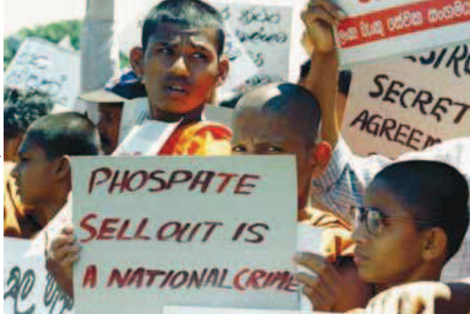
A foretaste of things to come? In Sri Lanka, the decision to award a phosphate mining concession to a foreign consortium led to widespread protests.