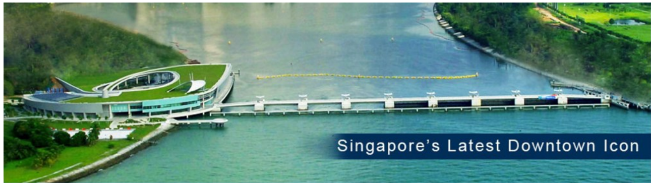
Marina Barrage, Reservoir and installation building, view from the sea.

The reservoir, with a catchment area of 10,000 ha and a surface body area of 240 hectares, is the nation's 15 th reservoir, and supplies 10% of national demand. 16,17 It also serves to recharge the larger capacity Upper Peirce Reservoir, located in the center of the island, by pumping fresh water through a 13.32km network of underground pipes. 18 Together with Serangoon and Punggol, two new reservoirs constructed with similar barrages, the Marina Reservoir has achieved a water drainage basin spanning two-thirds of the country's total land area in 2011. 19,20 Singapore is one of few nations in the world to harvest storm water on such a large scale for drinking water supply. 21