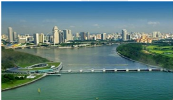
Marina Reservoir and Bay, view from the sea.

Finally, another difference between the nations can be perceived on an ethical/utilitarian level. The EPA has been aiming to protect wellheads and watersheds through the Wellhead Protection Program, which distances contaminating land uses and activities from the wells, and displays public signs to alert and inform citizens about responsible behavior when entering a particularly sensitive water resource area. 72 This is not the case in Singapore, where almost a sixth of all the land acts as a catchment area for the Marina Reservoir, a main source of potable water, and thus responsibility for water safety is felt ubiquitously throughout the nation. This becomes increasingly important as PUB hopes to make 90% of Singapore into water catchment areas. 73 Instead of a riparian or a prior appropriation doctrine, Singapore relies entirely on a public trust doctrine, where the government administers and regulates water issues in the public interest. 74,75