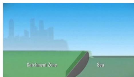
Left: Marina Barrage mechanism, showing diagonally tilted “open” gates. Right: Marina Barrage, with “open” gates; excess water from the reservoir is