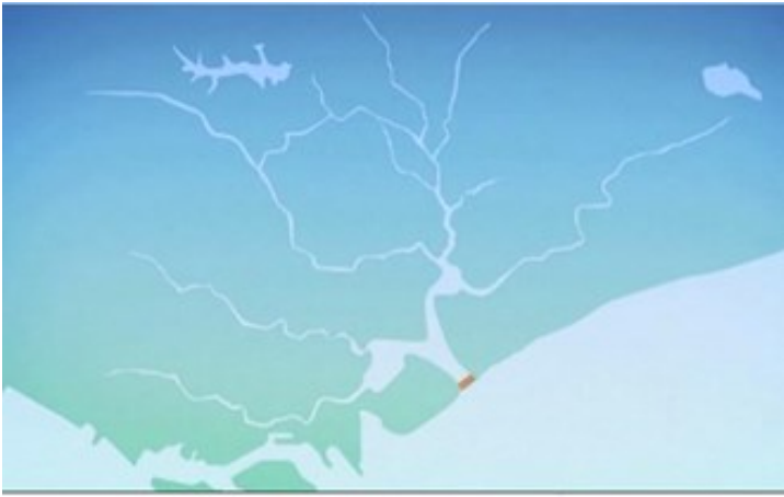
Marina Barrage (in red), Marina Channel and Estuary.

ishing their inclination to pollute or vandalize it. 36 Singapore has successfully established water security as not only the responsibility of government, but also that of each individual. 37 The educational function of the Marina Barrage and Reservoir is further reinforced by the barrage's installation building, which hosts a sustainability gallery with an interactive multimedia exhibition, a green roof, and a 1200 m 2 photovoltaic installation, the nation's largest. 38,39 The Marina Bay has also attracted private companies as sponsors for water-related projects around the reservoir, among them the soy sauce giant Kikkoman Corporation, which donated $1 million to the nearby Gardens by the Bay project that filtrates water through complex water circulation systems and special plants before it enters the reservoir. 40 Moreover, Singapore's efforts to become a "living laboratory" for smart water management and planning have attracted local and foreign firms in the smart urban technology sector to develop, promote, and inaugurate their products in the country. 41