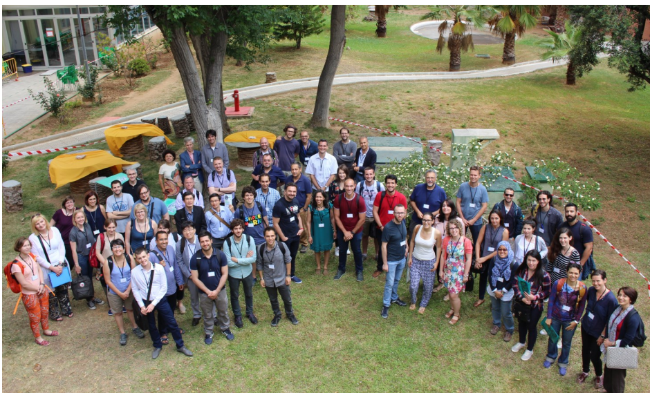
ANSWER Summer School _ June 13-23, 2016