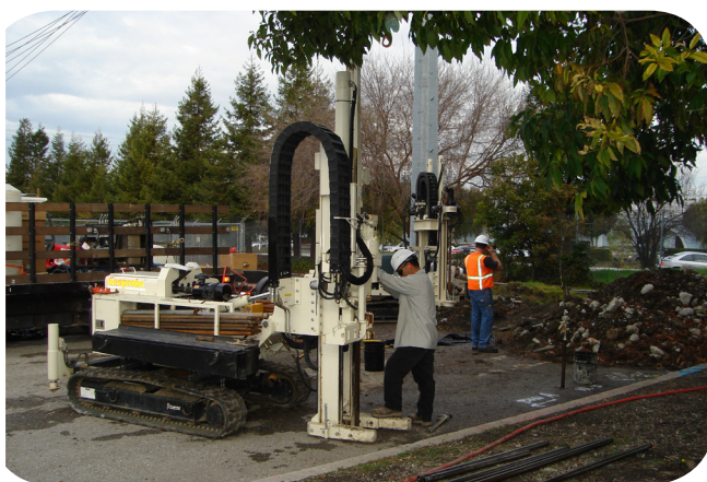
Injection of vegetable oil underground to improve conditions for bioremediation.

Bioremediation has successfully cleaned up many polluted sites and has been selected or is being used at over 100 Superfund sites across the country.